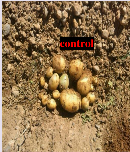
The effects of Bostano on potato - chaharmahal and bakhtiari - borujen - 2015