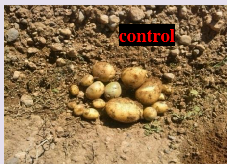
The effects of Algora on potato - chaharmahal and bakhtiari - borujen - 2015