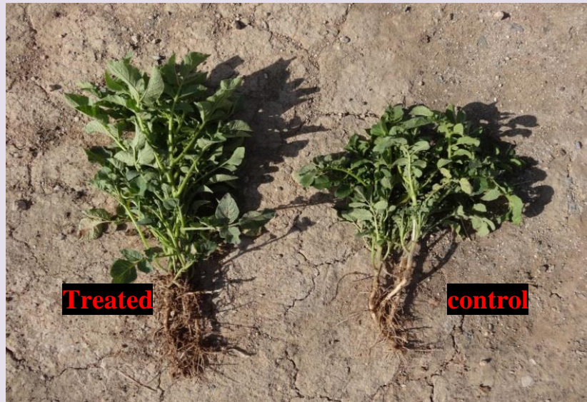
The effects of Algora & Waker mix on potato Kordestan - ghorveh - 2015