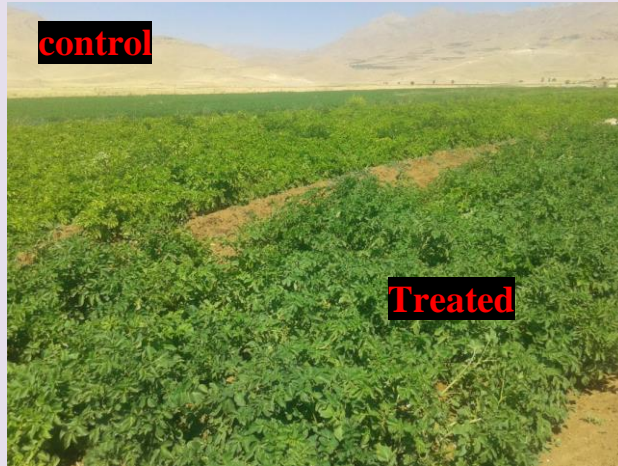
The effects of Bostano on potato - chaharmahal and bakhtiari - kiar - 2015