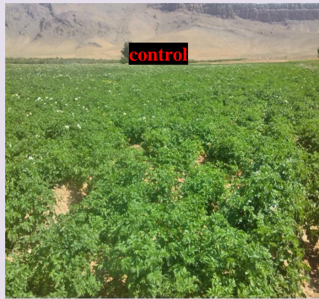
The effects of Waker mix on potato - chaharmahal and bakhtiari - borujen - 2015