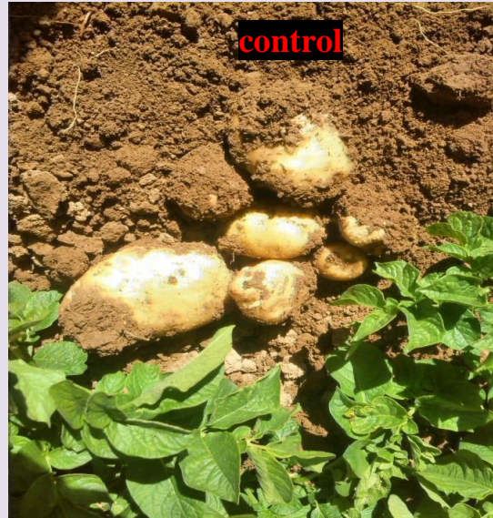
The effects of 15-5-30 + 2 MgO Aria on potato - chaharmahal and bakhtiari - borujen - 2015