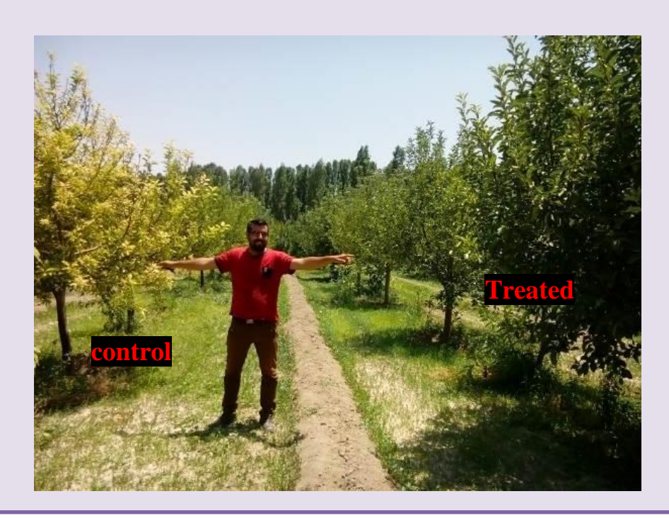
The effects of Waker Fe on apple tree - West Azerbaijan – salmas - 2015