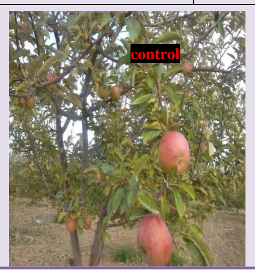
The effects of Waker Ca on apple tree - Chaharmahal and Bakhtiari – borujen - 2015