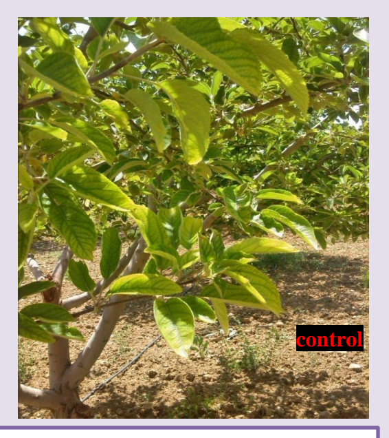
The effects of Diport on apple tree - Chaharmahal and Bakhtiari – borujen - 2015