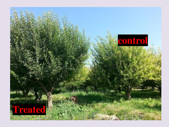
The effects of Waker Fe on apple tree - West Azerbaijan – salmas - 2015